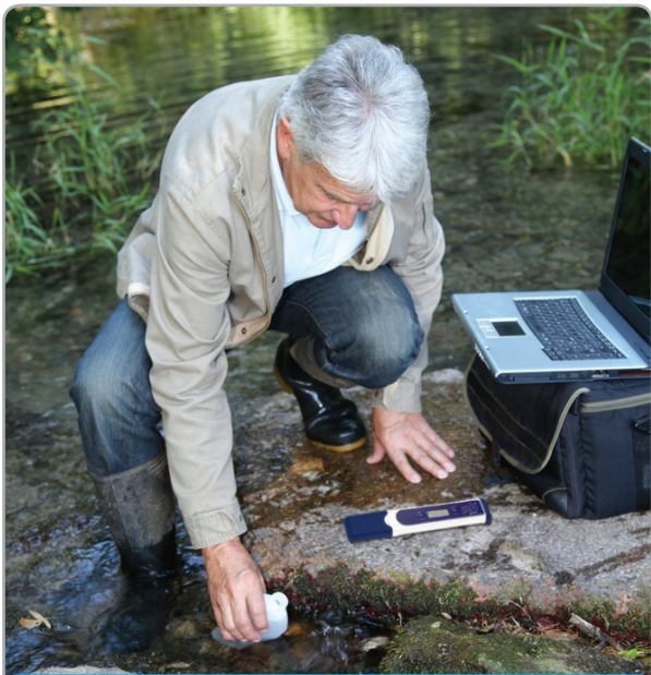
description pH Pal Plus pH tester 7.00 pH buffer solution